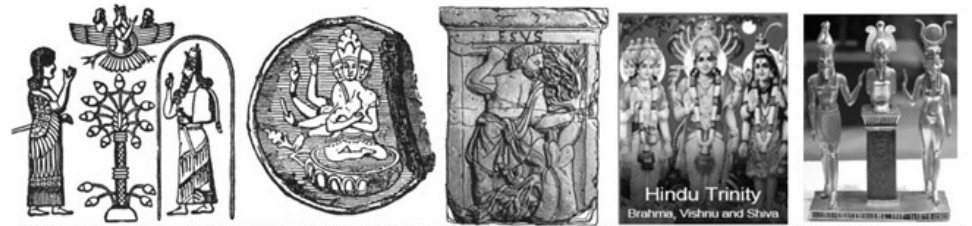
NIMROD TRINITIES EXPRESSED IN PERSIAN, CELTIC, HINDU, AND EGYPTIAN CULTURES

prominent image for the Islamic faith. Adherents are trained to bow to a building in Mecca (Makkah, meaning destruction or slaughter in Hebrew) containing images of the host of heaven. These have sexual symbolism associated with them. Babel's fertility practices have filled the planet with idolatry.